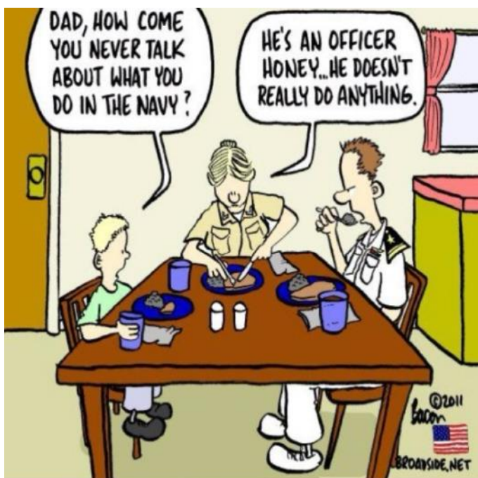
Why they don't allow fraternization.

"It is nobler to serve than to be served"