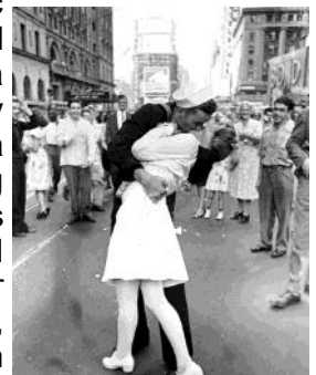
photo taken by Alfred Eisenstaedt for Life magazine, a uniformed sailor passionately kisses a nurse in the midst of a crowd of people celebrating in New York City's Times Square. On September 2, Allied supreme commander General Douglas MacArthur, along with the Japanese foreign minister, Mamoru Shigemitsu, and the chief of staff of the Japanese army, Yoshijiro Umezu, signed the official Japanese surrender aboard the U.S. Navy battleship Missouri, effectively ending World War II.

"It is nobler to serve than to be served"