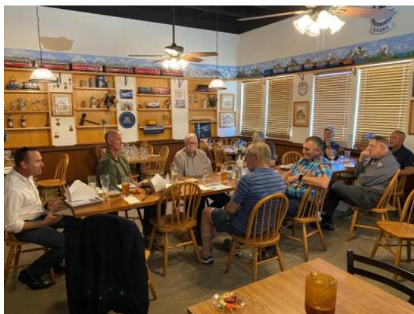
Members Meeting over lunch at our new meeting room at the Bavarian Grill. Much better arrangements for our meetings and associated program recognition functions.

"It is nobler to serve than to be served"