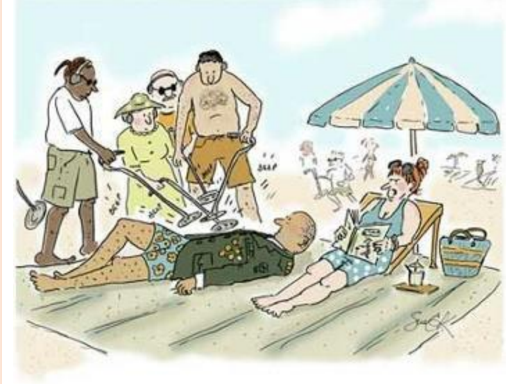
"Serves you right - I told you not to wear those to the beach."