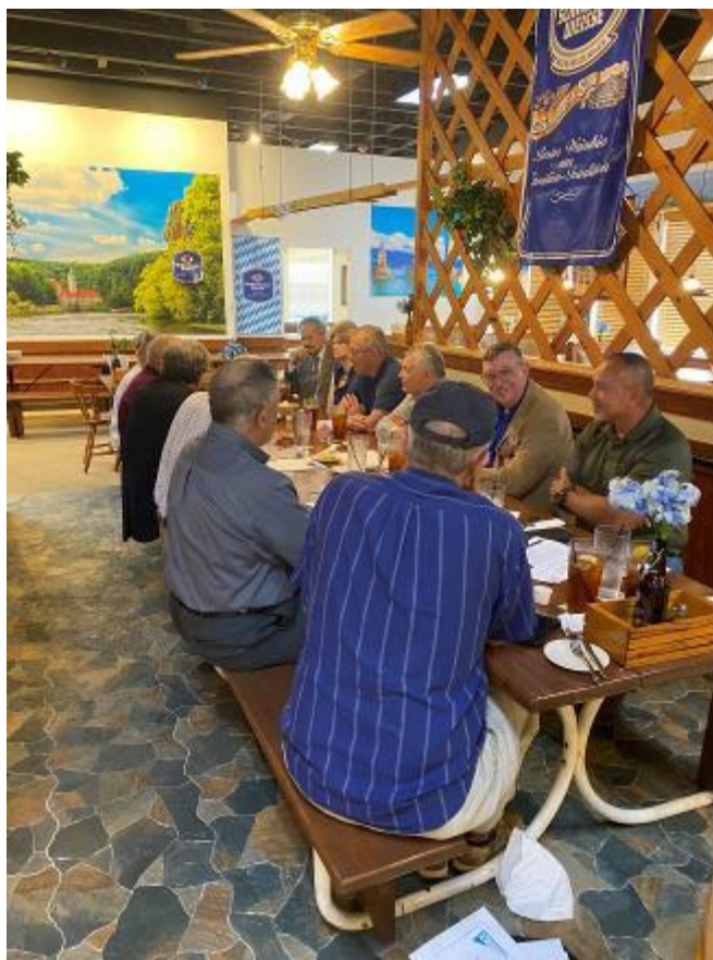
MOWW North Texas Chapter (234) Companions meeting over lunch to discuss status of upcoming Youth Leadership Conference activities, pertinent post—MOWW Region VIII Spring Conference actions and upcoming Chapter-related events.